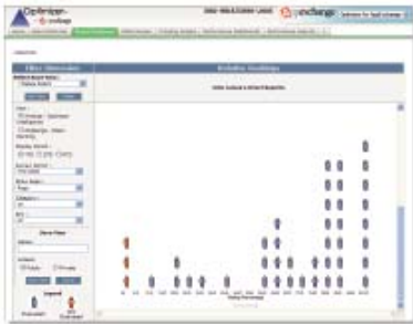
Graphical Team Analysis