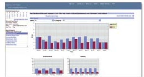
Sales Coaching Module with Offline Edition