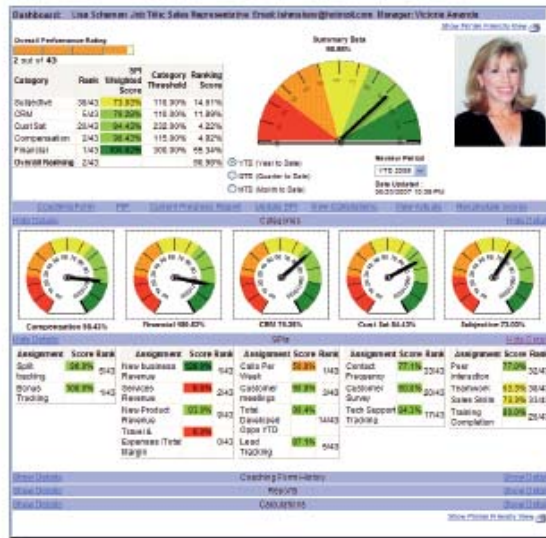
Sales Performance Dashboards